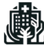
GH ALAPPUZHA HOSPITAL